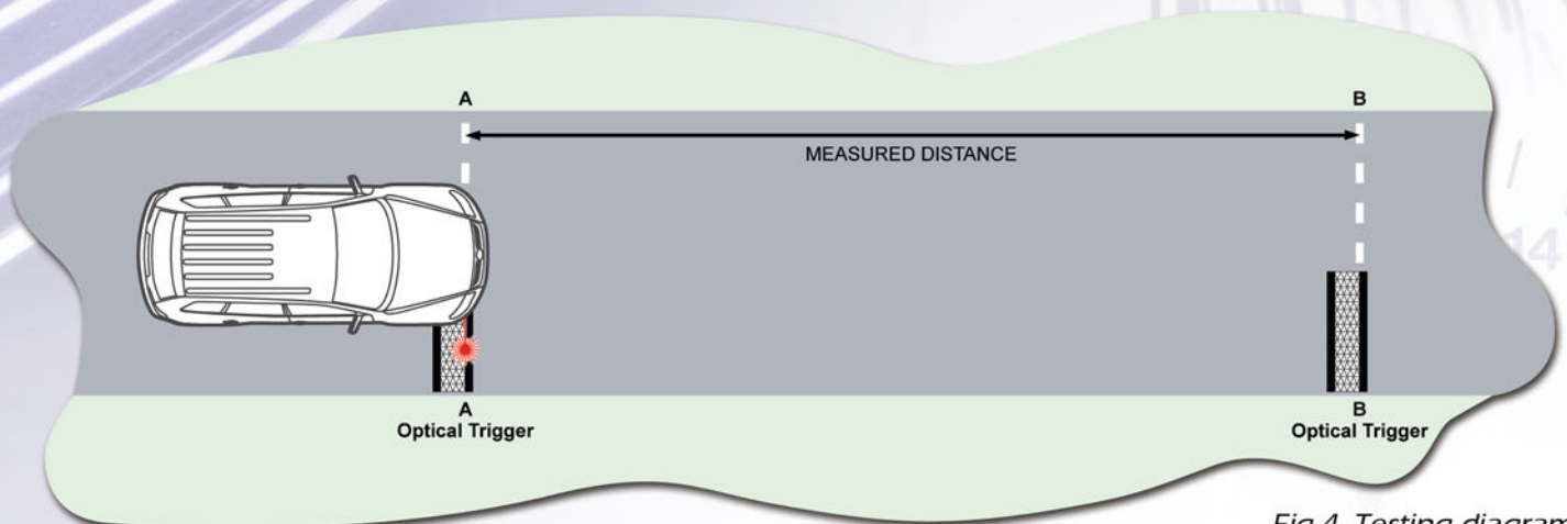
Fig 4. Testing diagram