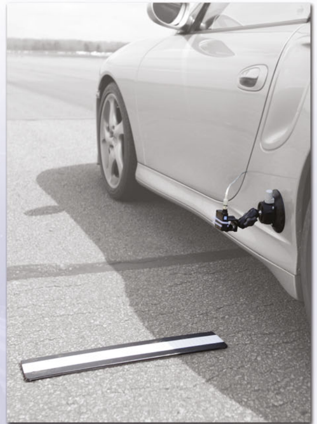
Fig 3. Laser barrier recommended installation

Compare the distances from the DASH4PRO with those measured with a class 1 tape. Making sure to measure between the same points on the two strips i.e. back edge to back edge of reflective strip.