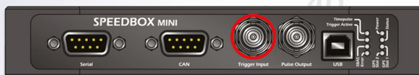
Fig 2. Trigger input location

Connect the output of the laser barrier to the trigger input on the SPEEDBOX INS: